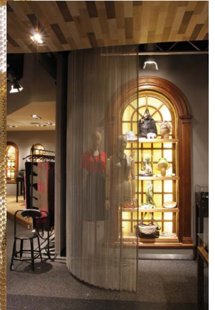
Cara & Co, Sydney, Foster & Associates