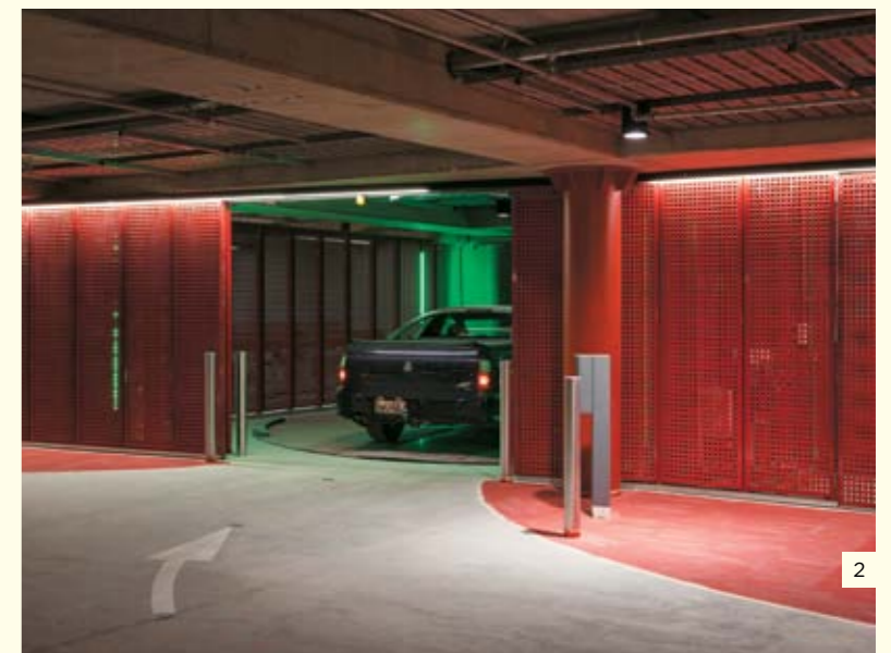
1. Interior view showing penetration of natural light through the twin façade at Geyser, in Parnell. 2. The building's automated car stacker in action.

We don't sell our buildings, so we want them to continue to provide us with a good income. We want them to perform in a recession. Ironbank's not full, but it opened in the midst of a recession, and there's still a recession now.