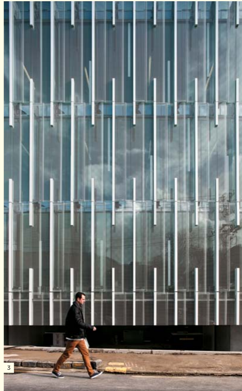
3. Geysler's twin-skin façade consists of laminated low-E glass, top-hung, frameless, manual sliding doors and laminated glass fins connecting to the operable outer skin.

Our company is old; we're rational and we're careful and frugal with our money. We've been managing our buildings for a long time and we like them to be energy efficient. We try to make them good for our tenants because if our tenants' outgoings are low, and our rentals are around the market level then they'll stay. If the building is good, they'll stay. Geysler is an amazing building from the exterior but, when you're actually in the spaces, they blow you away. It's completely naturally ventilated, and it's won a Green Star innovation point for its lighting. It's the lowest energy-usage lighting ever designed in the country and it has really nice features. The rent is market rental for this kind of space in this area. The utility costs are just minimal. There are human benefits to being there. ♦